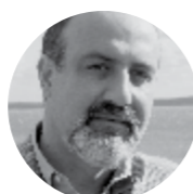
Prof Nassim Nicholas Taleb