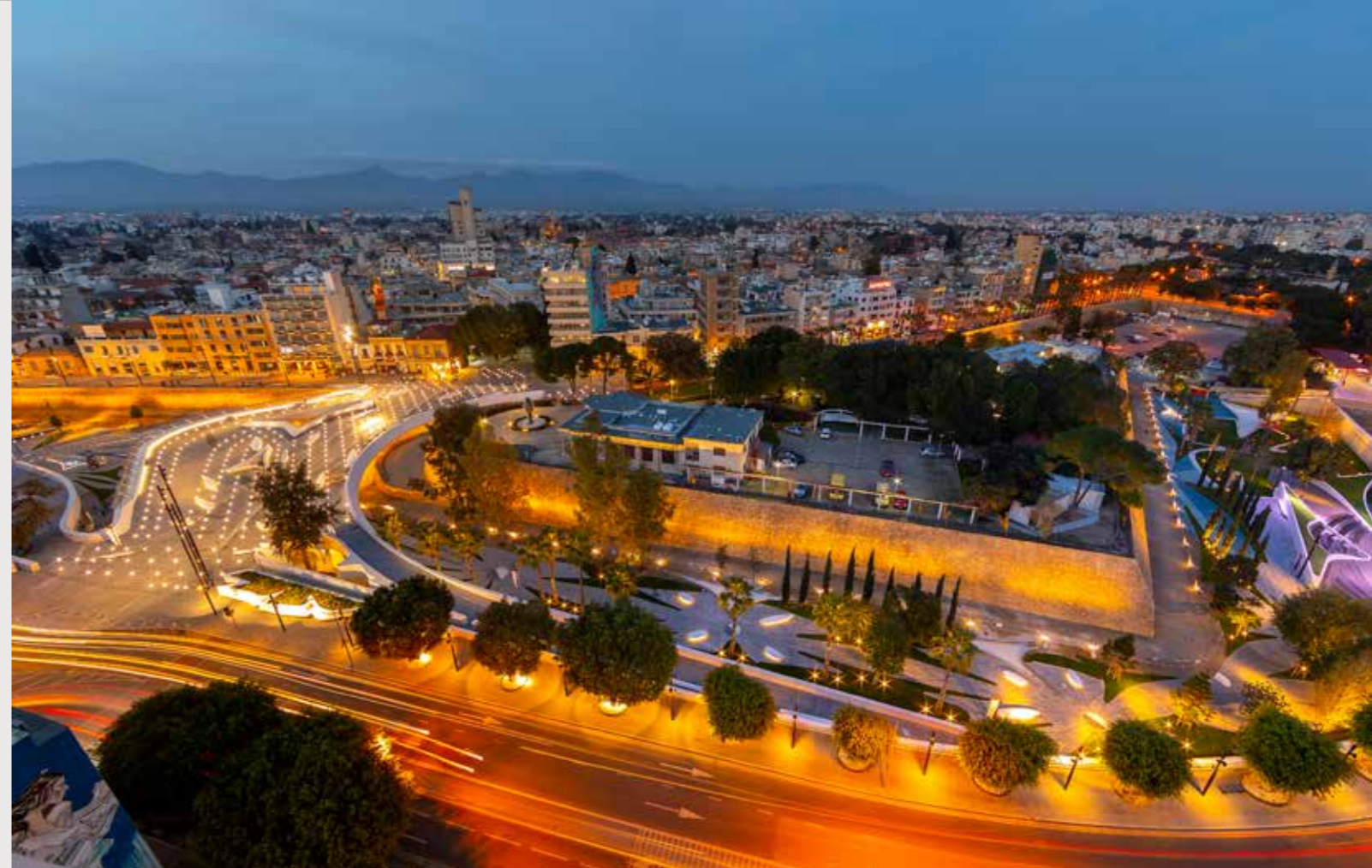
Nicosia Medieval Walls

Moreover, UNIC is the first European university to be awarded a 5-Star rating for Online/ Distance Learning and the 13th university in the world to receive such a distinction. In addition, UNIC received the highest distinction of 5-Stars in Teaching, Facilities, Inclusiveness, Social Responsibility and Internationalisation.