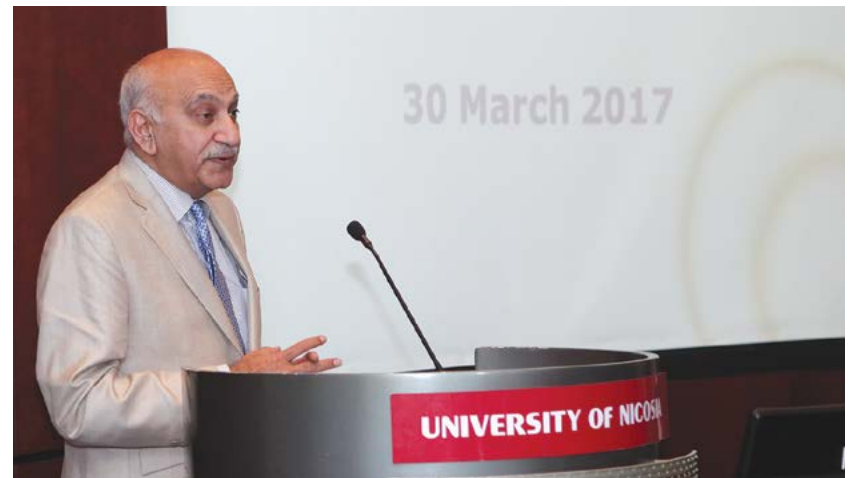
Balance of Power Vs Pendulum of Power (March 30, 2017)