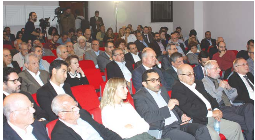
Current Developments in the Cyprus Problem (November 10, 2015)