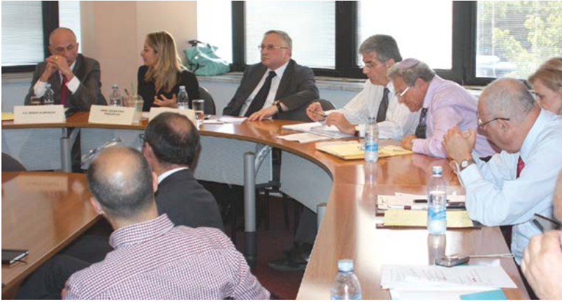
The Ukrainian Crisis and the Fall Out (May 6, 2015)