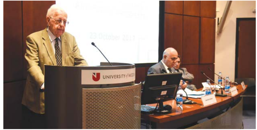
40 Years After the Begin-Sadat Agreement – A Historical Assessment and Future Prospects (October 23, 2017)