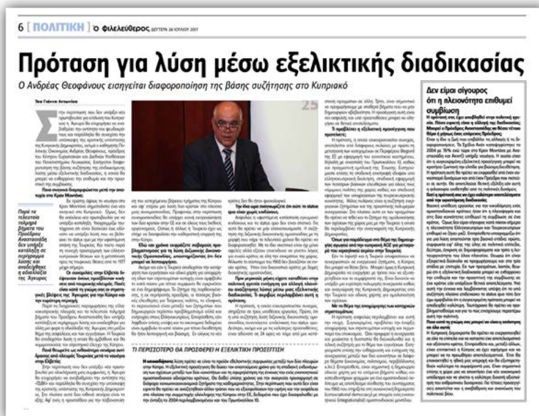
Interview of the President of the Center – Proposal for an evolutionary approach for the solution of the Cyprus problem, Phileleftheros, (July 24, 2017)