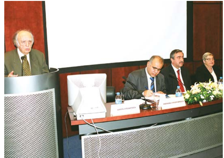
Revisiting the Cyprus Problem (October 26, 2005)