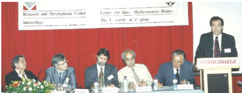
Cyprus and the European Union (May 7-9, 1998)