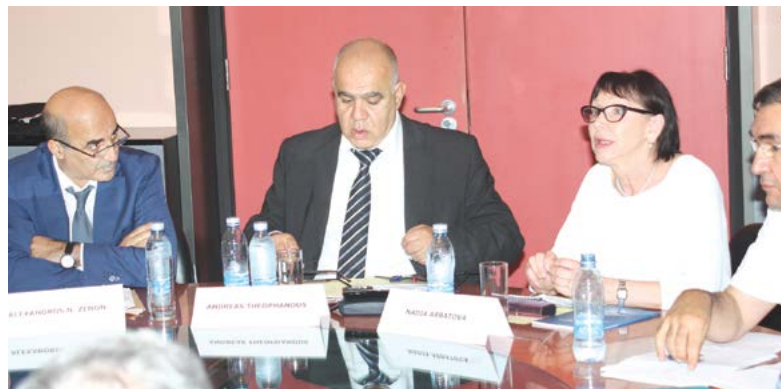
Geopolitical Developments and Change in the Eastern Mediterranean and the Middle East (June 16, 2016)

Over decades the Center has gained the reputation of a prominent think-tank on matters revolving around Cyprus, regional security and economic analysis. Its expertise is frequently sought after by leading local and international media agencies. The Guest Speakers who have visited the Cyprus Center since its creation include politicians, diplomats, technocrats, academics and journalists. In addition to Cyprus, our speakers come from several countries including Australia, Bahrein, Bulgaria, Canada, Egypt, France, Germany, United Kingdom, Greece, Israel, Italy, Lebanon, Russia, Serbia, Slovenia, Turkey, United Arab Emirates and the United States.