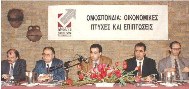
The Economic Aspects and Consequences of a Federal Solution to the Cyprus Problem (January 22, 1994)