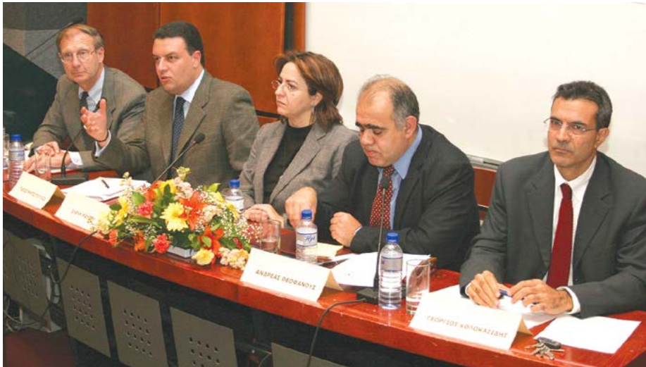
Perspectives on The Cyprus Problem and Turkey After December 17, 2004 (January 13, 2005)