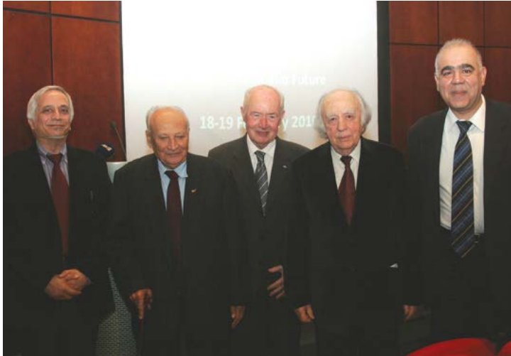
The Republic of Cyprus at Crossroads Past, Present and Future (February 18–19, 2010)