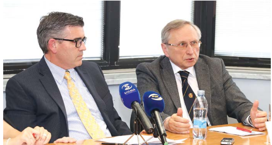
EU, Russia and the US in the Trump Era (April 7, 2017)