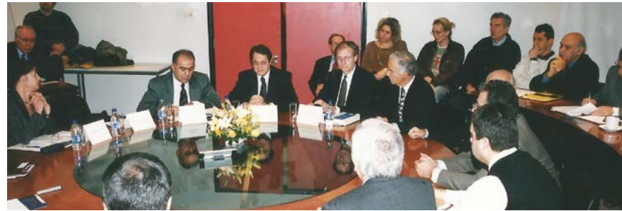
The USA, the EU and the International environment after September 11, 2001 (December 3, 2001)