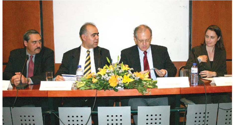
Cyprus Accession to the EU and the Day After (May 20–21, 2004)