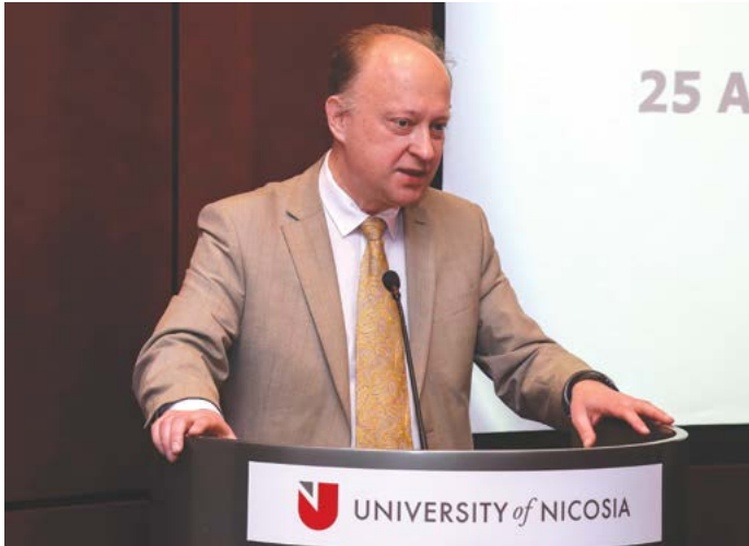
Russian Foreign Policy in the Eastern Mediterranean and the Middle East (April 25, 2017)