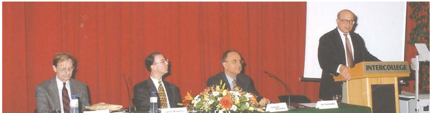
United States – Cyprus Relations: The American Foreign Policy Process and the Role of Greek Americans (November 13, 1999)