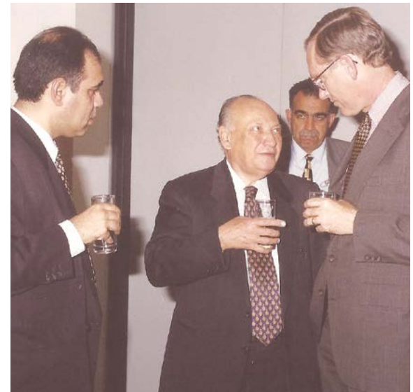
International Symposium, The Cyprus Problem: Its Solution and the Day After (April 3–6, 1997)